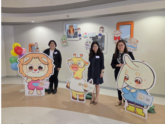
賽馬會「童心理情」計劃：學習情緒管理由小做起，約1400名小三及小四學生化身情緒練習生。(11 April 2025)