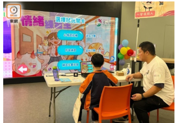
賽馬會「童心理情」計劃：樹仁心理學系設網上遊戲偵測困擾，及早發現學生情緒問題。(11 April 2025)